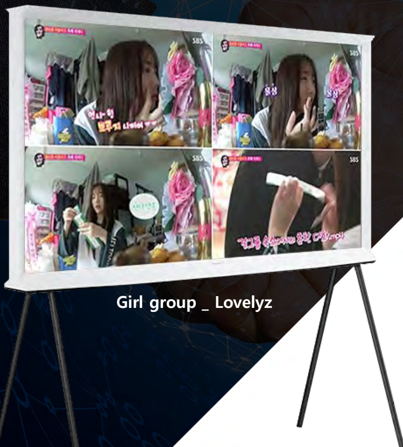
Girl group _ Lovelyz